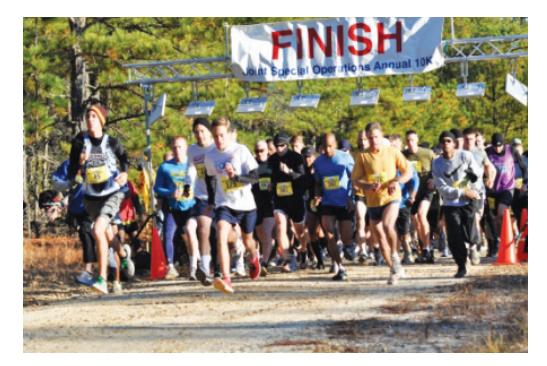
The Joint Special Operations 5K Run/5K Walk is a great event for seasoned runners and for families.

The race, certified by USA Track and Field, is sponsored by the Special Operations Communicators Association.